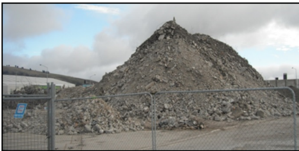
The remains of the 'Waters Edge' Apartments following demolition.

resource consents had been lodged with the Christchurch City Council.