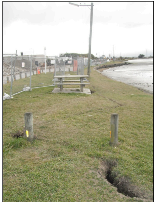
Significant lateral spreading on Tidal View

we need to ask whether we design buildings, so that they can endure numerous earthquakes (post-quake serviceability (Smith, 2011)) or whether they are designed so that like Water's Edge, they are beyond repair but perform in such a way that no loss of life is endured and that they will not collapse. When it is the human race verse Mother Nature it is possible that we ought to design so that although uneconomic no loss of life occurs.